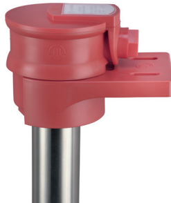
Angular Immersion Heater with HWB Support

ROTKAPPE angular immersion heaters consist of the heated horizontal immersion tube, the long-life heating cartridge, the unheated vertical immersion tube, the terminal casing and the lead.